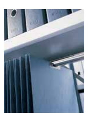
ZT pendel frame